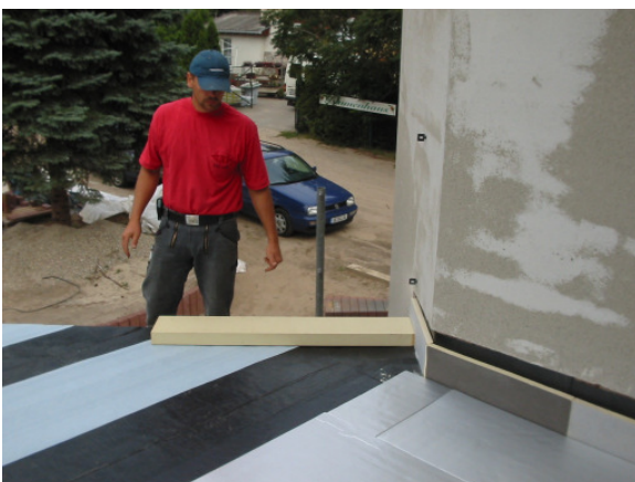
Figure 3: Forming the gutter with polyurethane insulation boards and the wall joint with perpendicular insulation made from phenolic resin foam.

Figure 2: Second layer of VIPs being laid in a different alignment to the first. The VIPs are fixed with self-adhesive tape. The two VIP layers (each 15 mm thick) ensure an insulation efficiency in line with DIN 4108-2 even if the vacuum is no longer in tact.