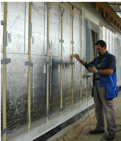
Figure 3: Monitoring the gas pressure within the VIPs with the portable "va-Q-check" device.